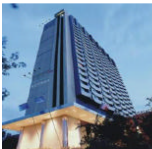
Hotel Pullman, Paris

The Congress 2010 will be held at two nearby locations. The Pre-